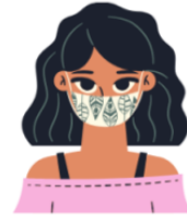
Tour guide and customers are required to wear a face covering

We are all adopting new personal habits and routines to stay safe. The uncertainty surrounding the coronavirus is causing travelers around the world to pause or re-think their travel plans. We recognize that beginning to travel again is a very personal decision. We will be here when the time is right.