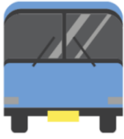
Nightly deep cleaning