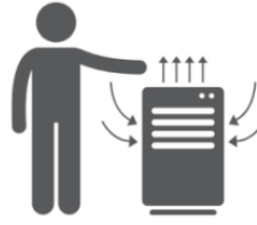
HEPA filters installed